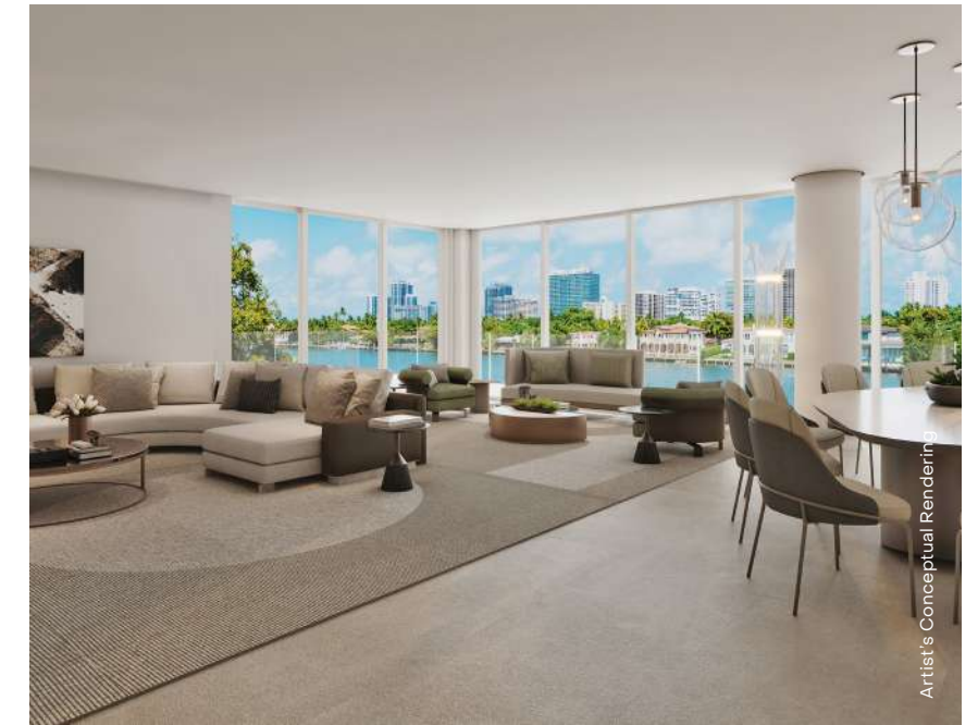
Residence Living Room

Enjoy direct ocean access from the comfort of home with boat slips right at your door.