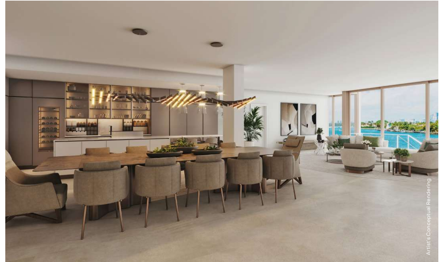
Residence Dining Room

Featuring wrap-around, floor-to-ceiling glass windows in every home, the architecture is inspired by a contemporary aesthetic, with streamlined features, tropical elements, and natural materials such as sand-colored stone, travertine, and bleached woods, creating a resort-like feel.