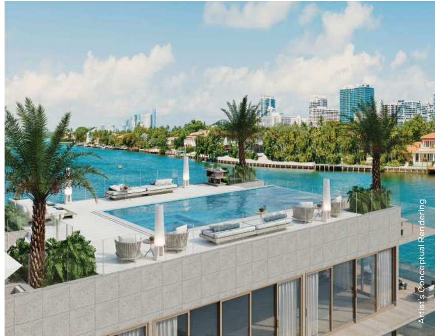
Signature Collection Rooftop

The large floor plans, surrounded by floor-to-ceiling glass exterior walls and terraces, feature a measured progression of rooms and spaces that feels luxurious and distinctive, with private and semi-private elevators that add to the feeling of retreat. The building is uniquely oriented on the island, facing east over the water to allow sunlight to move through the homes from sunrise to sunset as it travels along its southern axis and facilitates airflow throughout each residence.