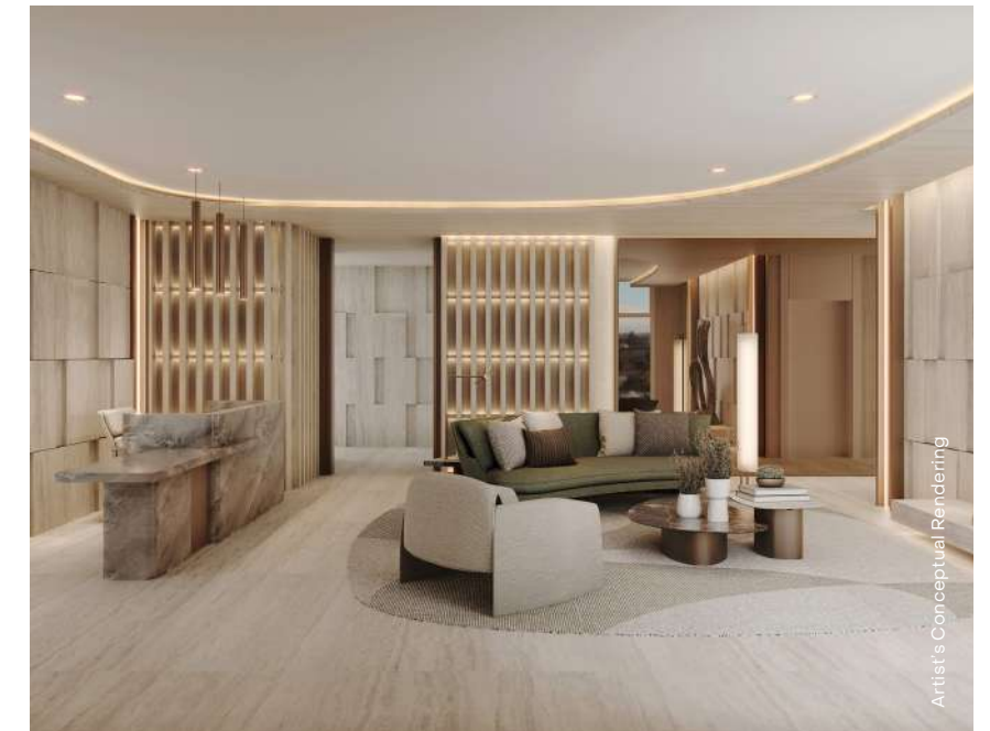
Signature Collection Lobby

Featuring wrap-around, floor-to-ceiling glass windows in every home, the architecture is inspired by a contemporary aesthetic, with streamlined features, tropical elements, and natural materials such as sand-colored stone, travertine, and bleached woods, creating a resort-like feel.