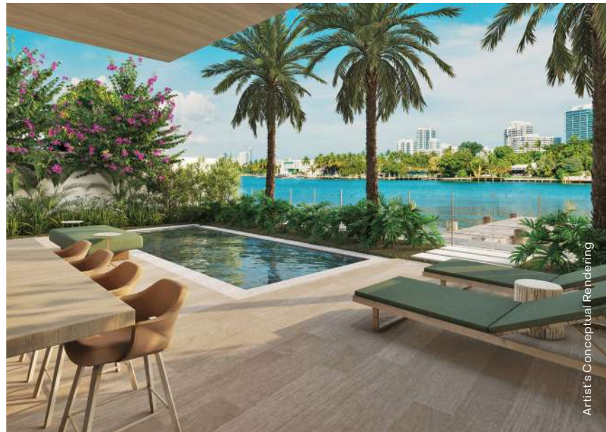
Residence Private Deck

Enjoy direct ocean access from the comfort of home with boat slips right at your door.